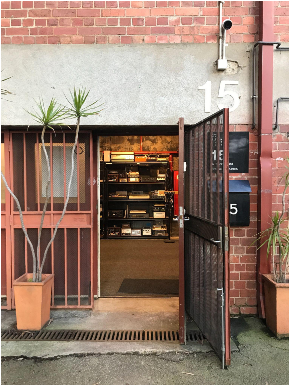
Image Description: A photograph of the main entrance to the MESS studio, looking at the front door which is open.