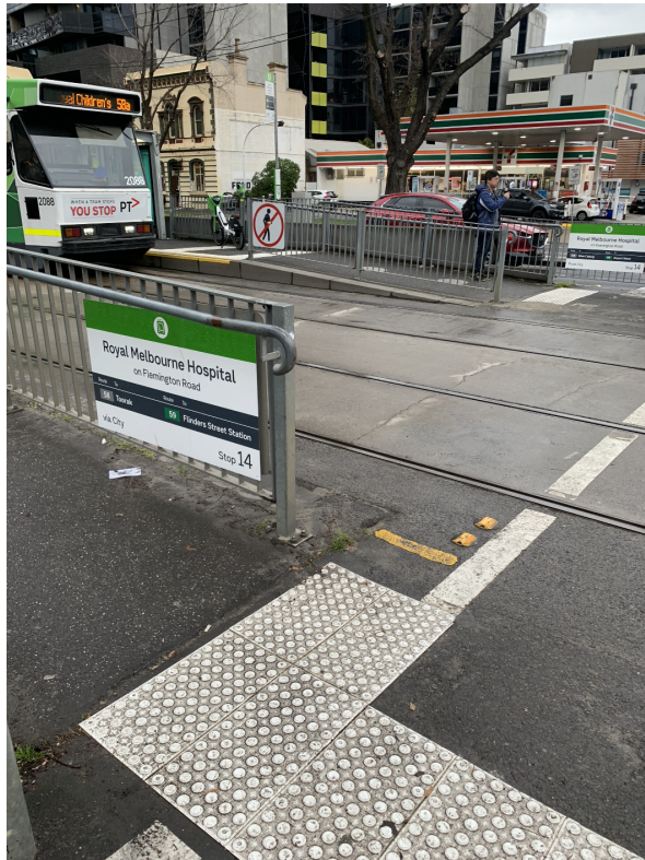
Image description: Photo of Royal Melbourne Hospital 14 tram stop. This tram stop is accessible and has ramp access on both sides to Flemington Road.