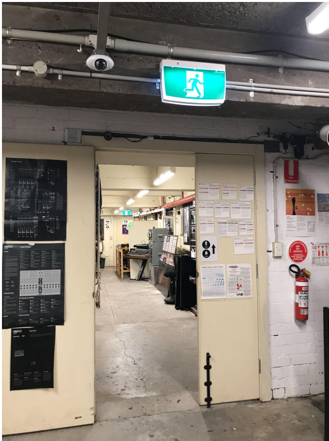
Image description: A photo of the internal double doors that lead from the main studio into the workshop area. The door is half open at 81cm width.