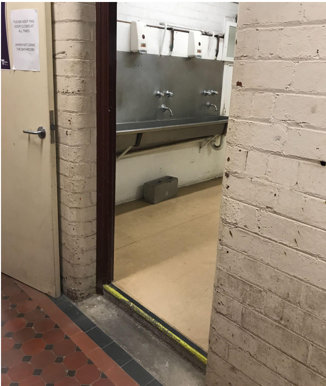
Image description: Photo of the open bathroom door showing small step and the sink.

The bathroom contains 3 lockable toilet stalls and 1 urinals in a separate stall. 2 of the toilet stalls contain a sanitary disposal bin. The toilets have a large trough-sink with 3 taps. The taps are at a height of 1m and the soap dispensers are at a height of 1.38m . A pump soap bottle is also available at sink height.