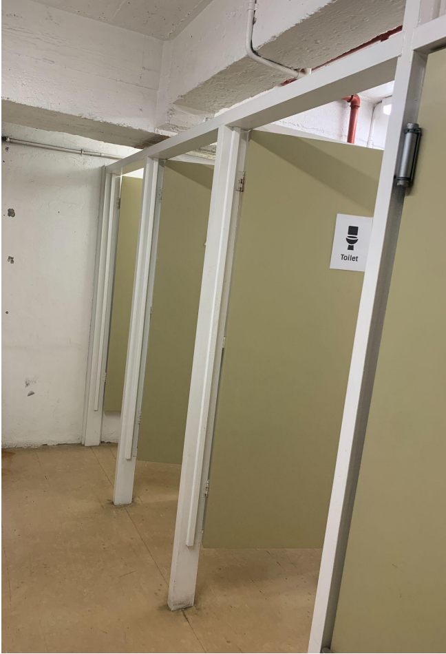
Image description: A photo showing the inside of the gender neutral bathrooms. Image ends.

There are accessible toilets located throughout Meat Market, use of these facilities requires leaving the Studio and entering the main Meat Market building. The closest available toilet is approx 100m from the MESS Studio located in the Stables. A MESS staff member can facilitate access to these toilets.