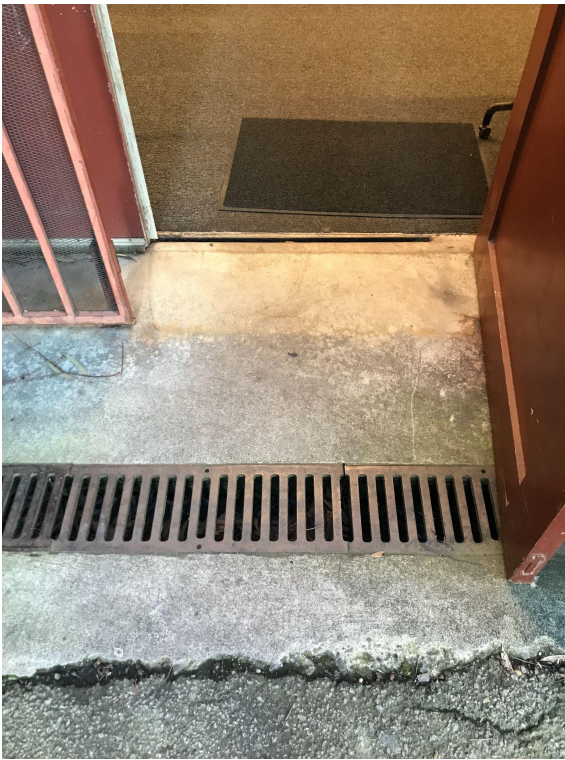
Image Description: A photograph of the floor at the front door to the MESS studio. The entryway surface is a combination of bitumen and concrete that is slightly uneven in places. There is a narrow drain with a metal drain cover that is level with the concrete. The floor inside the studio is concrete covered with thin, tightly woven carpet. Image ends.