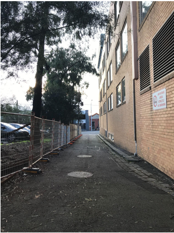
Image Description: A photograph of Dowling Place laneway showing a bitumen surface that is slightly uneven in some areas. This photo is taken from the front door at MESS, looking out onto the laneway towards Wreckyn Street. Image ends.

The MESS studio is located on the ground level and there are no stairs upon entry or within the studio. Dimensions for the main entryway measures 92cm in width.