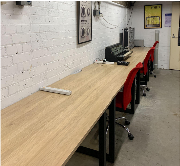
Image Description: Picture showing tables measuring 73cm in height and 180cm in length. Image ends.

There is small incline when accessing the back area of the studio which is commonly used for workshops and classes. This area also contains a kitchen and the workbench where our technician works. The door to the toilets is also in this area. The double door to access the workshop area measures 81cm wide when half open and 131cm wide when fully opened.