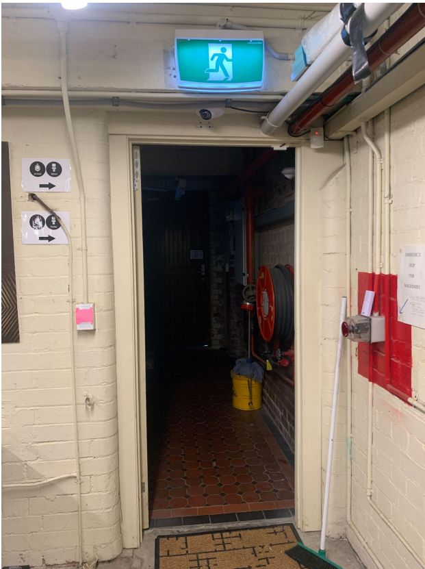
Image description: A photo showing the doorway from the workshop area to the hallway where the toilets are located.