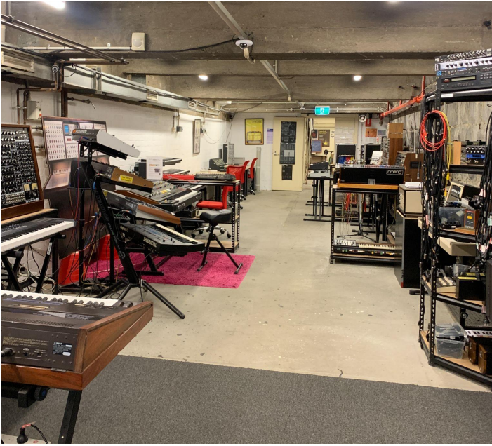
Image Description: A photograph of various table and keyboard stand options and heights located within the studio.