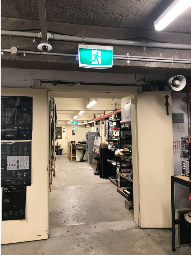
Image description: A photo of internal doors fully open at 131cm wide. Image ends.